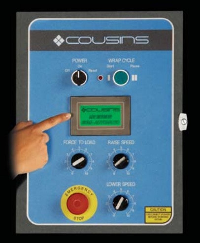
Panasonic PLC complete with Touch Screen operator interface