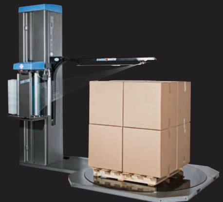
The Switch with A-Arm installed